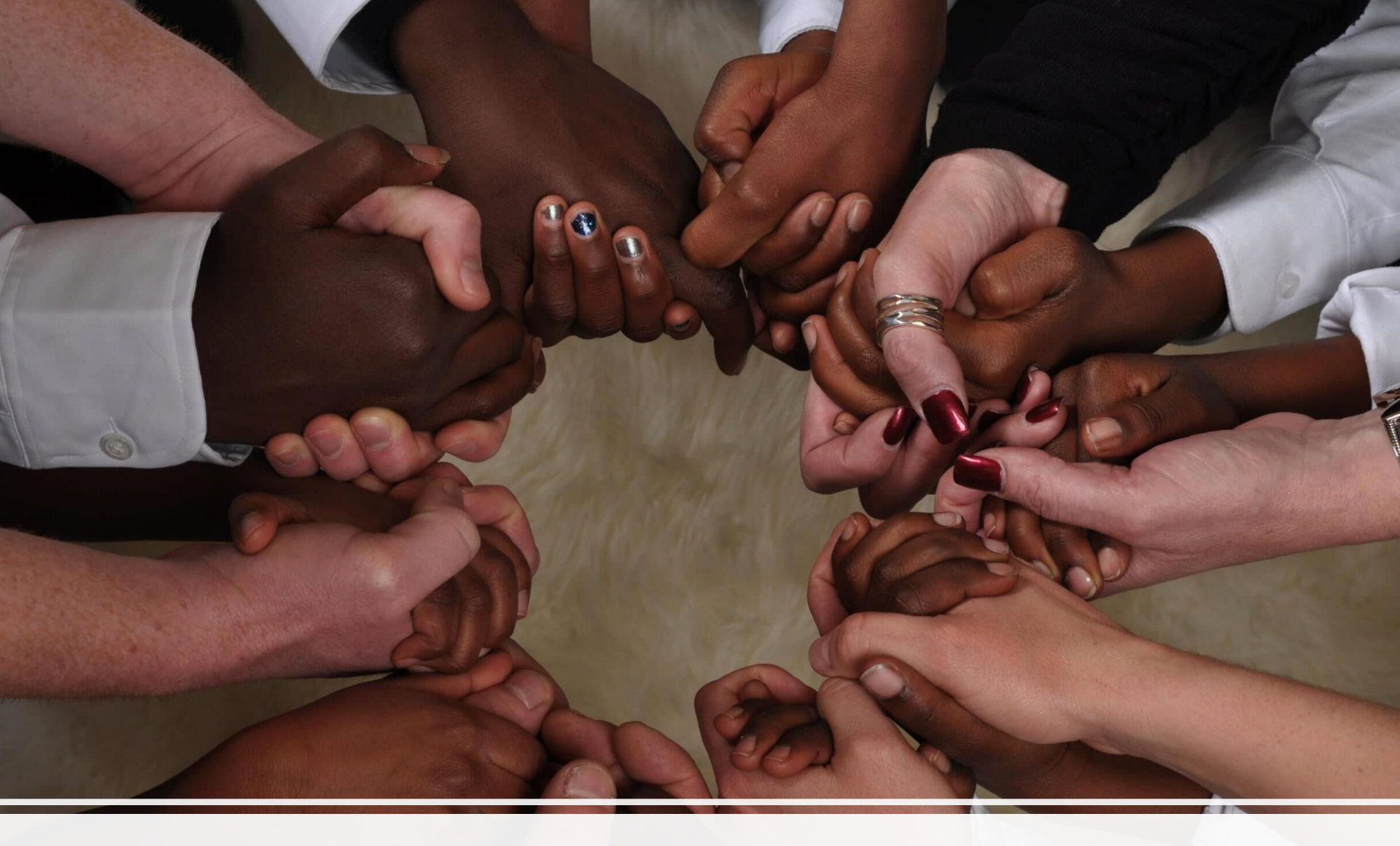
Prayer Gathering at 9:30 AM on Sunday, April 14, 2024