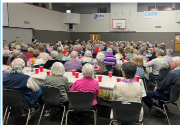
The 2024 Spring Dinner