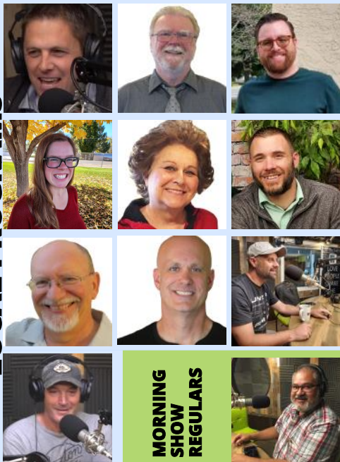
MORNING SHOW REGULARS