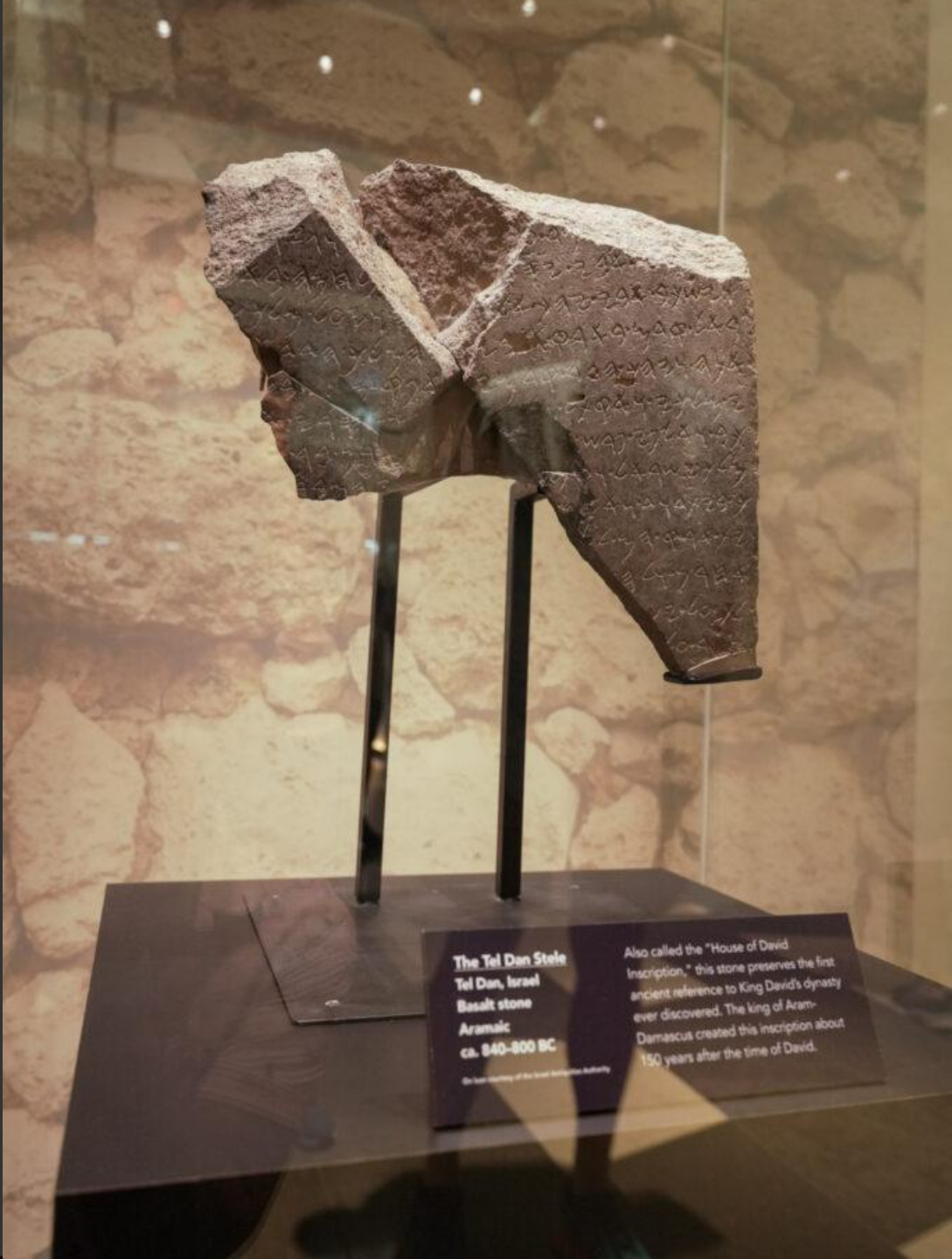
The Tel Dan Stele Tel Dan, Israel Basalt stone Aramaic ca. 840-800 BC

Also called the "House of David Inscription," this stone preserves the first ancient reference to King David's dynasty ever discovered. The king of Aram-Damascus created this inscription about 150 years after the time of David.