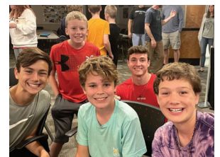
Youth Night 10/23

There will be NO Youth Night tonight due to Fall Family Day. Hope to see you all at Fall Retreat!