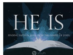
Current YN Series: "He Is"

For anyone in 6th-12th grades to explore how to follow Jesus and to connect with others in a safe, fun environment.