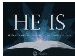
Current YN Series: "He Is"

For anyone in 6th-12th grades to explore how to follow Jesus and to connect with others in a safe, fun environment.