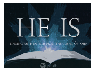
Current YN Series: "He Is"

For more details on upcoming events, see the GC Youth calendar online or in the GC app.