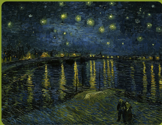
"Starry Night" Vincent Van Gogh

Our Father, in heaven, Hallowed be your Name; Your kingdom come; Your will be done on earth, as it is in heaven: Give us today our daily bread; And forgive us our sins, as we forgive them that sin against us; And lead us not into temptation, But deliver us from evil: For Yours is the kingdom, the power, and the glory, For ever and ever. Amen.