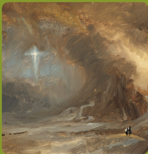
"Vision of the Cross" Frederic Edwin Church

God has mercy upon us and forgives us our sins and heals our wounds in Jesus Christ.