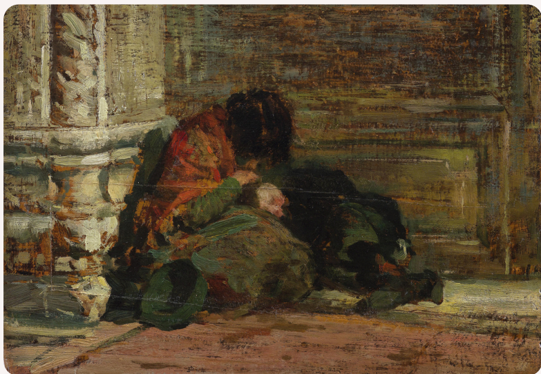
"Abandoned" Luigi Nono