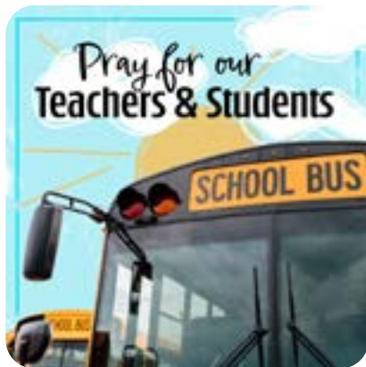
School Starts This Week!