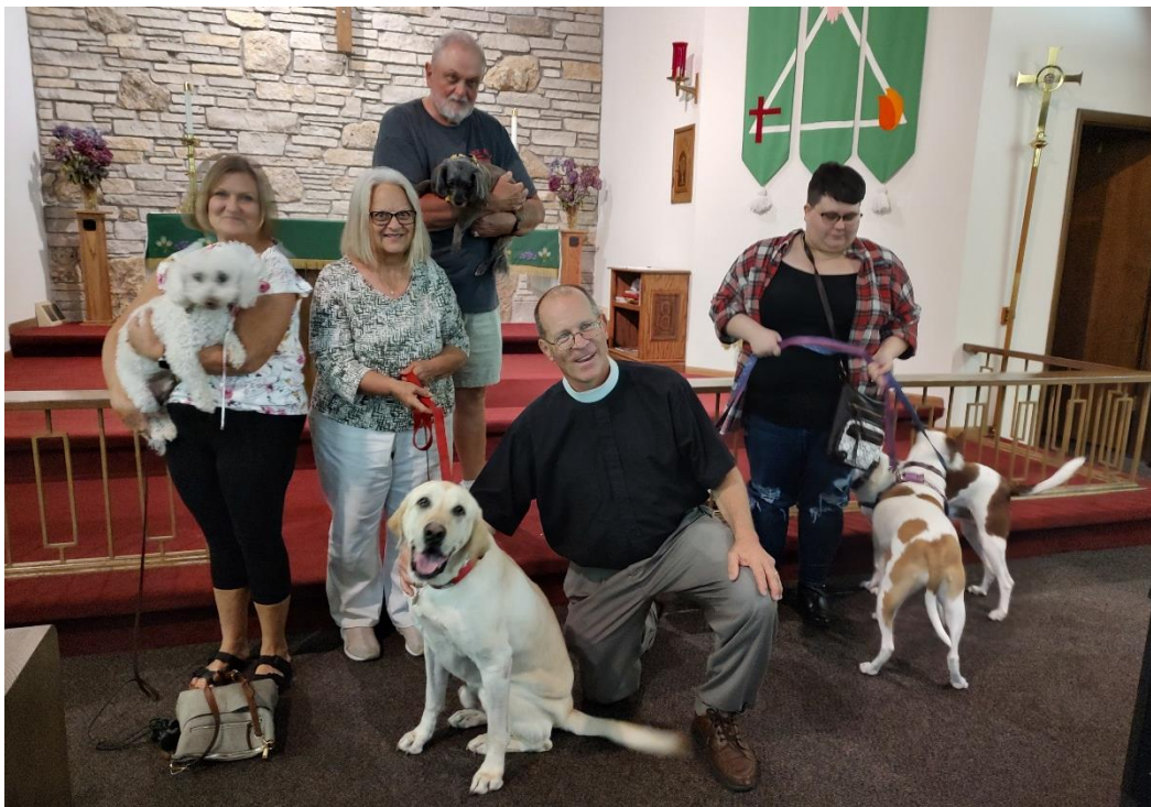
Blessing of the Animals October 2023