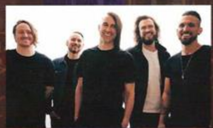
HONOR & GLORY