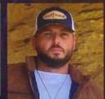
RARE OF BREED