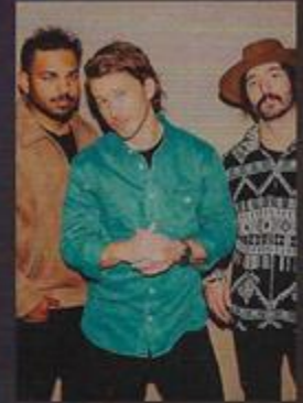
TENTH AVENUE NORTH