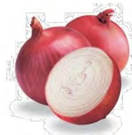
בצל - (batz-al)