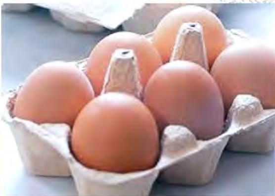
(beit-zah is one egg)