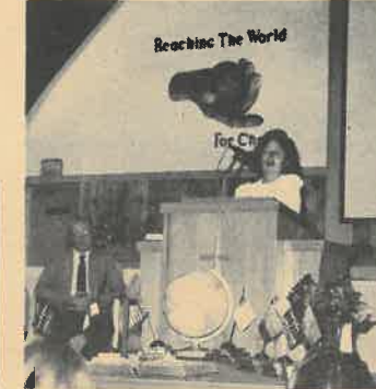
1985 Missionary Conference