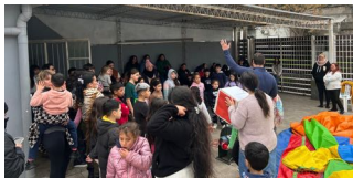
Witnessing to the children and their parents