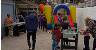
Some games we rented