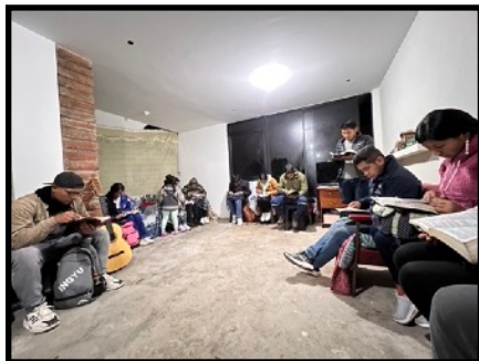
New Bible Study!