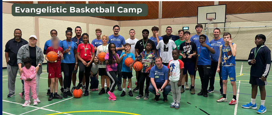
Evangelistic Basketball Camp

Looking Ahead: Please keep these upcoming opportunities in prayer: