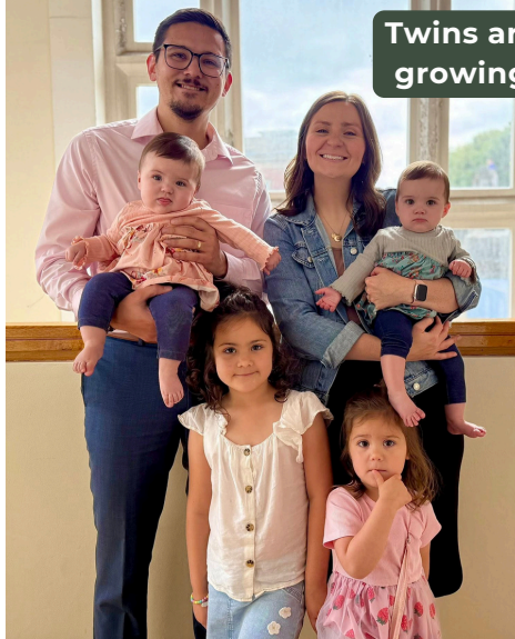
Twins are growing!