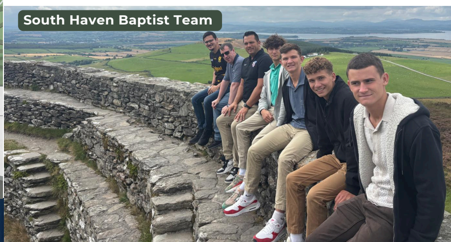
South Haven Baptist Team