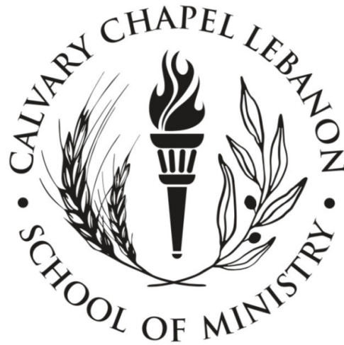
School of Ministry Graduate