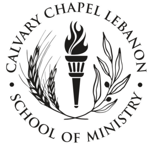
School of Ministry Graduate