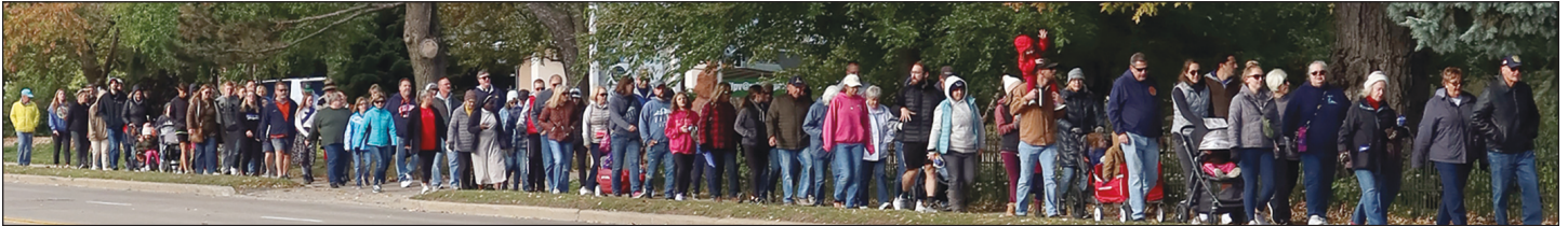
Walkers supporting Bella Medical Clinic dressed warmly for the chilly morning and spread the message of help for women in unexpected pregnancies. The Walk for Life 2023 goal of $50,000 was met!