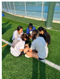
Girls praying for family whose house burned

Fire: In mid-October, just as I got to school, I saw flames burst from a house next to our school. For almost 2 hours, I stood at one gate and directed the students back to the playground where many were waiting. Others from the train were guided to a nearby park. As they waited, several 8th grade girls on the playground prayed for the family, school, and everyone involved. I am so thankful that none of the family from that house was hurt. Though the house is right next to our school, there was very little damage to that part of the gym. Our students continually asked about the family all day long since the house is clearly visible from our classroom window. One 8th grade girl wrote an encouraging note to the family in Japanese and the middle school raised about $500 to give to the family. The photo of the girls praying was also included. In mid-November, the wife from that family asked if she could come and thank the 8th grade students. She came and spoke briefly, but was very positive about rebuilding. Just before she left, one boy asked to pray for her and her family. Quite honestly, the whole class was moved by this whole experience, and we have been seeing a positive change in many as a result. Praise the Lord!