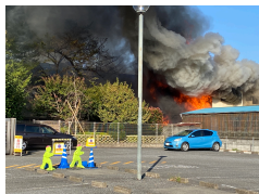
Fire next to CAJ

CAJ: This year’s class of 8th graders is truly a blessing. Yes, they are often challenging, but the Lord is working in their lives. Every Wednesday, several students join the student-led Bible study at lunch time. One girl recently wrote, “I want to know how to love and to be humble to God with everything. How can I show it?” Another has been asking about how to be a Christian. Yet another wrote, “Even when I doubted God for making us wait for a long time on something, I realize that He knows what the right time is.” I love having these kinds of conversations with my students! I am so thankful for God’s timing in all of them.