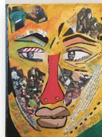
(Left) Black men killed by police

I worked at Central for 10 years and am grateful for the opportunity. I want to thank Central Baptist Church, the Pastors and the Leadership for allowing me to serve and work for them.