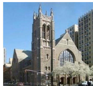
The site of Central Baptist Church today on West 92nd St & Amsterdam Ave.

The Central Baptist 180 th Anniversary Committee