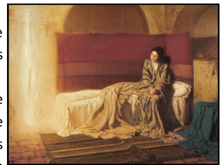
The Annunciation by Henry O. Tanner

Christian doctrine refers to this miraculous conception as the Virgin Birth. The Virgin Birth of Jesus remains one of the most controversial