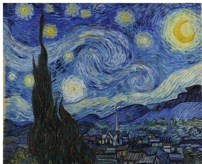
Starry Night by Vincent Van Gogh

But, there was something even more wonderous in the sky on that special night the star shined so brightly. It illuminated the way to Bethlehem that led the Three Kings to Baby Jesus. They knew that He was a king and brought gifts worthy of a king. He was a king who would encourage love for one another and embrace peace and joy. Oh, it was a night of love, worship and praise!