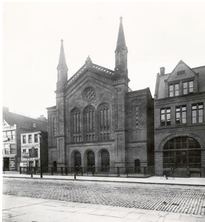
Above: The site of Central Baptist Church in 1861 on West 42nd Street. Right: West 42nd now.

Central Baptist Church will be celebrating its 180th Anniversary on December 10th, 2022 from 3:00 to 8:00 p.m.