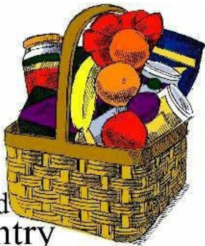
Food Pantry Ministry

Our current balance of $155,473 is getting us closer to the challenge of getting the loan below $100,000 by the end of 2021. Thanks to the donors who contributed a total of $1,208 towards the principal of the mortgage during April. The goal of the Board of Directors is to eliminate the church debt to provide funds for ministry. Some members have used part of their Stimulus checks to help this effort. To contribute you can write on you offering envelope the amount you wish to allocate to the mortgage reduction campaign.