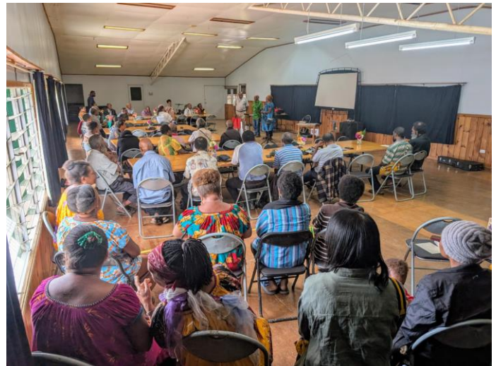
Pastors from surrounding villages learn about Bible workshops that the Wycliffe missionary team offers.