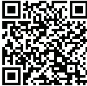
Intro to LWML Video

Since, 1942, the Lutheran Women's Missionary League has served as an official auxiliary of the Lutheran Church Missouri Synod. What does that mean? LWML affirms each woman's relationship with Christ, as well as encourages and equips women to live out their Christian lives in active mission ministries and to support global missions with their treasures.