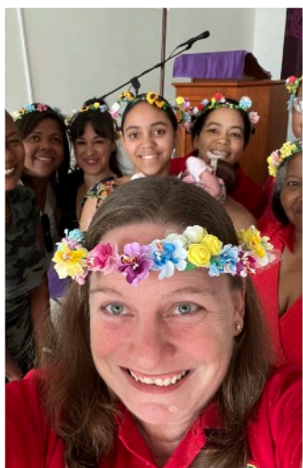
Fun flower crafts with the Pueblo Nuevo ladies

As they say in the Dominican Republic, nos vemos . This means, "We will see you." After 8 years of service in the Dominican Republic, our family is returning to the USA. These past few months have been busy, exhausting, and full of every emotion you can possibly imagine. I think the most accurate word I can use is "bittersweet." There is a lovely anticipation and excitement in looking forward to new challenges and service. However, this is accompanied by the bitterness of saying goodbye to so many incredible people that have brightened and enriched our lives over the past eight years. We will miss them terribly.