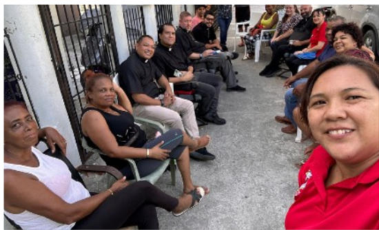
Last visit with the people of El Congo

just days before we left, we made one last visit to the community of El Congo, near Pueblo Nuevo. Over the past 2-3 years, we have made consistent visits here and catechized around ten people who are very active in the church. At our last visit, I shared a devotion on Acts 2:42, encouraging the faithful saints of that community of the blessing of apostolic doctrine, the Lord's Supper, worship, and fellowship. I know that the Lord will continue to bless the good evangelistic work of Word and Sacrament there in the years ahead.