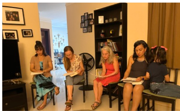
Seminary wives Bible study

In addition to working at Iglesia Luterana de Pueblo Nuevo and with deaconess students, I also gathered the seminary wives for fellowship and bible study. We continued to study the Psalms, with the latest study being on Psalm 100 and what it means for the daily Christian life. We have enjoyed painting crosses, making candles, and dinner and fellowship with our husbands. These ladies are amazing, and I pray for strength and peace for them as some of them get ready to head back to their home countries and take on the role of Pastor's Wife.