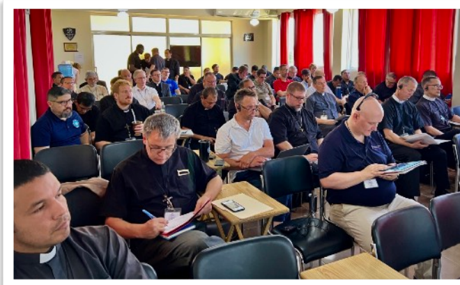
CMSCR Symposium 2023 in the DR

speakers were professors from our two LCMS seminaries and the three seminaries in Latin America (Argentina, Brazil, and the DR).