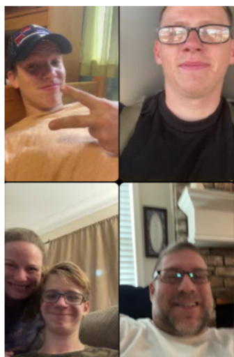
Mother's Day FaceTime

Fritsche family, what is next for you all now that you have left the DR? We have a lot of changes and adventures coming up that we will be happy to share with you.