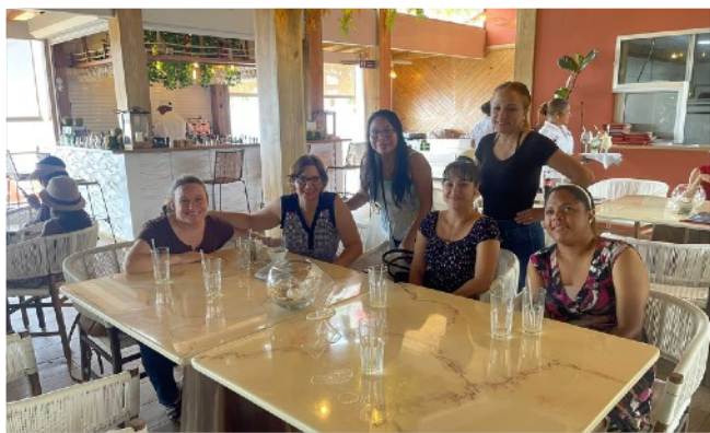
Celebrating with deaconess students

community visits. Some of the highlights of the past few months were our Valentine's dinner, making fun spring crowns, pizza and movie night, and an incredible Lenten and Easter season. There was a lot of discussion and preparation as well as the deaconesses of Pueblo Nuevo taking on more responsibility in my absence. It has been great to see their enthusiasm and how they are definitely up to the challenge. Even though I will dearly miss not being a part of all the church activities, Christ is the head of the Church and provides workers for the harvest!