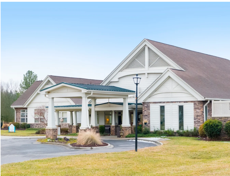
Robin Johnson Hospice House, Dallas, NC