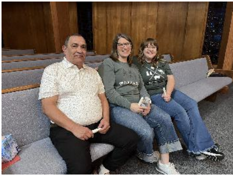
The battery-operated candles were safe and gave off a beautiful, gentle glow.