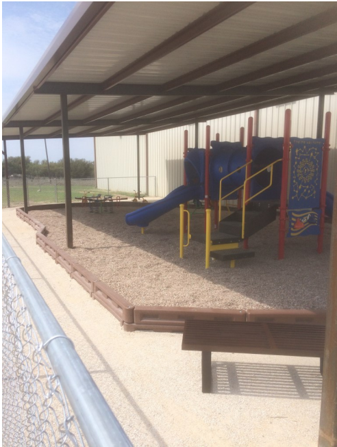
The new playground is completed on the east side of the Family Life Center. This will be enjoyed by children for many years to come!