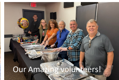
Our Amazing volunteers!