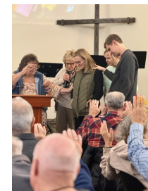
Our Amazing persons