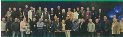
Leaders from at least 15 denominations, 4 countries and approximately 15 states attended the DCPI North America joint training and Summit in January 2024. Your support allowed 7 of us to share an Airbnb.