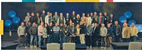
Multi Track Event Vista CA January 2024