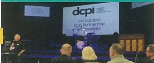
Presenting two new programs to North American Summit