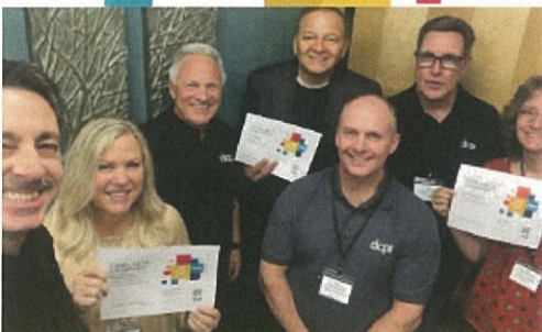
Training Healthy Church Dynamics at North America Summit, National and regional denominational leaders and a new missionary to Cambodia

“Therefore, go and make disciples of all nations, baptizing them in the name of the Father and of the Son and of the Holy Spirit, and teaching them to obey everything I have commanded you. And surely, I am with you always, to the very end of the age.” Matthew 28:19-20