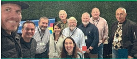
Churches Planting Churches (CPC)