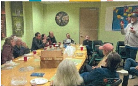
Fun, Food and Fellowship at the DCPI office