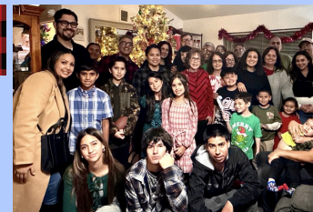
Family time is always the best for the Guerreros!