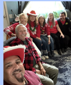
The Knowles Life Group Christmas Party... these folks are love being together!