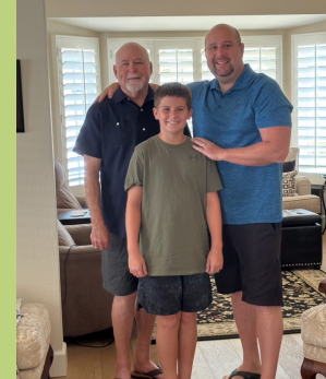
Three generations of Mogush men!