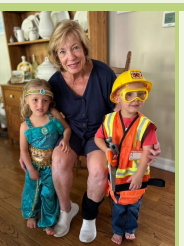
The Concialdis love having grandkids from Colorado here for a 10 day visit. There's lots of fun things planned!