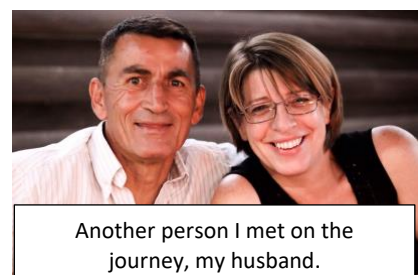
Another person I met on the journey, my husband.