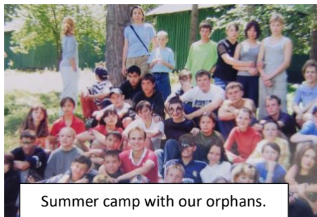
Summer camp with our orphans.

and continues to grow it in amazing ways. Then in Cyprus, God brought refugees across my path. The last group mentioned in Deuteronomy.