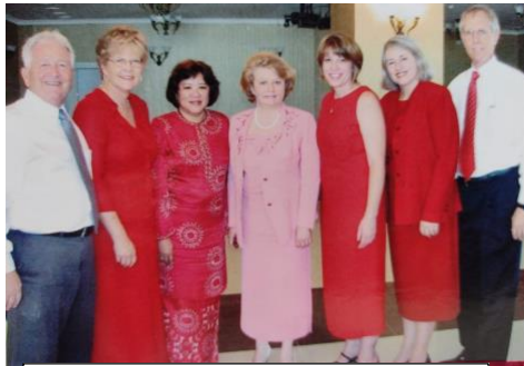
US teacher team who participated in our yearly teacher conferences.

When I left the US, I knew that God would use my English language teaching degree to serve Him. At the time, I thought I would teach English. God opened other doors. He burdened me with the need to equip mission workers who were teaching English or setting up language centers. Through God's leading, I was able to train both short and long-term teams, write curriculum to be used in their classroom and eventually provide them with the tools to set up language centers in closed areas to the Gospel. I also worked alongside national teachers, hosting conferences, and eventually leading a group of teacher