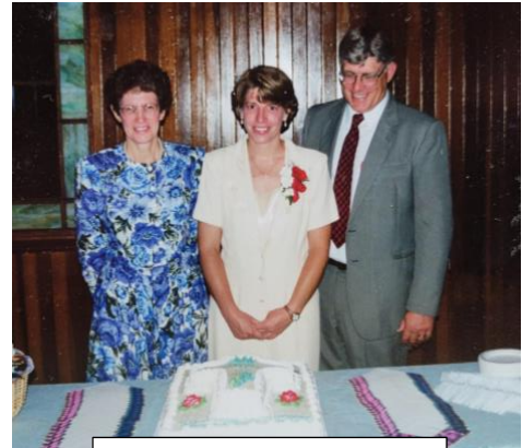
With my parents at my church's sending off service.

In the fall of 1998, I flew from America to a tiny airport of the newly established capital of Kazakhstan. My team leader met me inside the passport control area of the airport (not done nowadays), got me and my eight boxes through customs and transported us by ambulance to an apartment. That was the beginning of a twenty-five-year journey, first in Kazakhstan, where I lived for 12 years. While there, God used the gifts He had given me in the English language to serve other teams throughout Kazakhstan and in 4 other countries in the region. Then through God's leading, we began helping orphans. The journey then continued to Cyprus. In Cyprus, God brought asylum seekers to our church and a ministry began serving them.