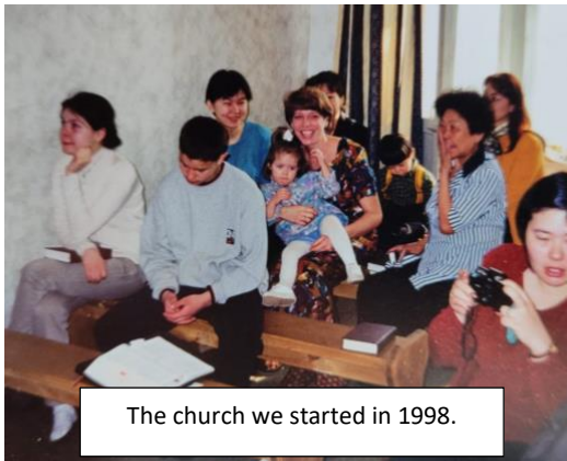
The church we started in 1998.

As I remember the many people I have met and the events that have happened, I am overwhelmed with a deep sense of gratitude and awe for the faithfulness of God. He protected, provided for all needs, and gave wisdom. He answered prayers, and rescued people from darkness and brought them into salvation. God brought comfort to the widow, protected the orphans, and gave a family to the refugees.