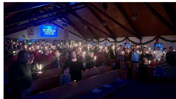
Christmas Eve Candlelight Service

Because when love makes space for us, we will make space for our neighbor.