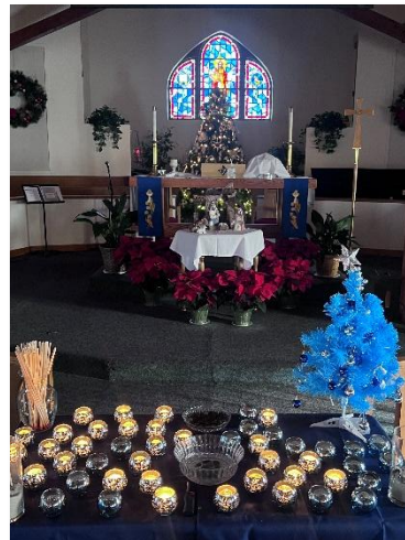
Blue Christmas Service