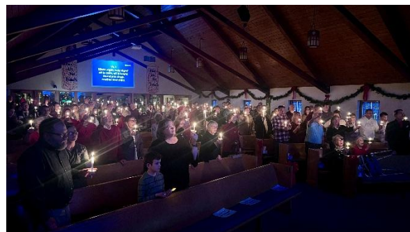
Christmas Eve Candlelight Service

Because when love makes space for us, we will make space for our neighbor.