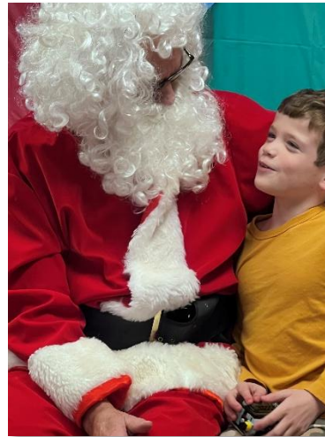
Visit with Santa