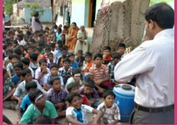
Children attending a VBS session.