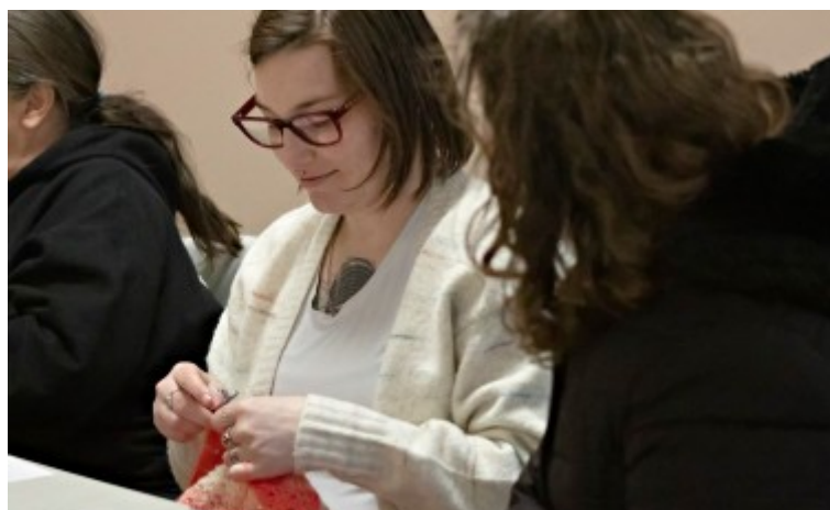
Prayer Shawl group members hard at work during a spring meeting.