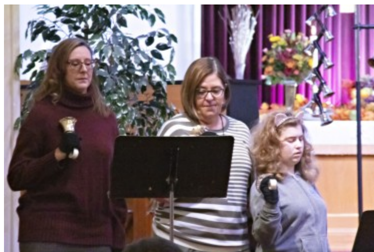
Members of the Intergenerational Bell Choir share their talents during a worship service last year.