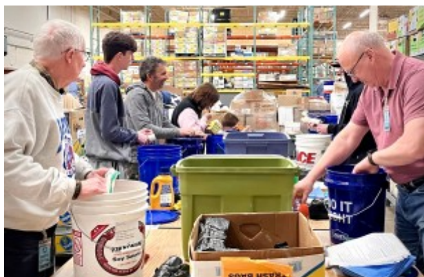
Above, Trinity disciples serve at Mission Central. The team will travel to the warehouse missions hub again on Friday, Oct. 10 . All are welcome.