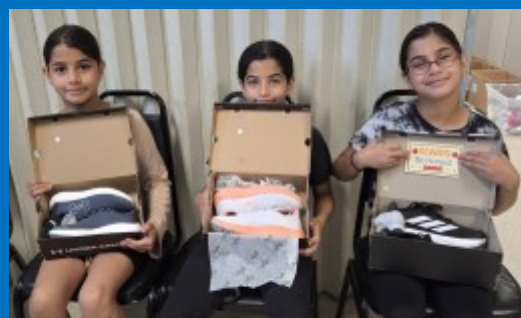
Students with their shoes at the 2025 event.

We're also grateful that Trinity hosts our annual Lace Up with Love INC Sneaker Drive and Distribution Event each year.