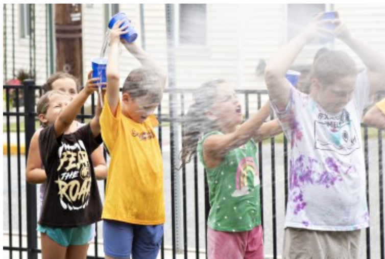
Outdoor games offered a chance to burn off some energy.

When you find the PERFECT color for your Bible lesson worksheet!