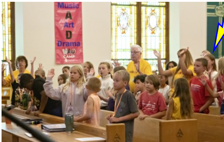
Singing from the pews on the first day, learning songs and motions.