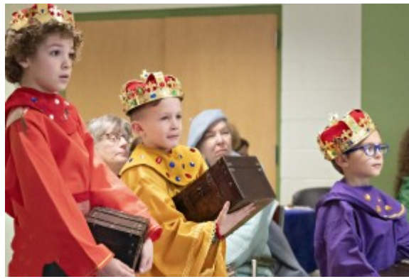
It was a packed house for our Jingle Jam, following our combined service on Dec. 14. The event featured our Kids Ministries students and included a fun singing of "The 12 Days of Christmas" as well as a retelling of the Christmas story. The kids did great!