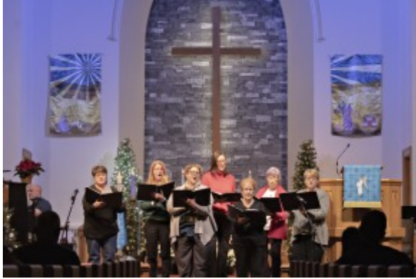
The Longest Night service created a safe space for those not feeling overly festive due to loss and life challenges. Attendees lit candles to name their hurts and remember Jesus as the light in our world.