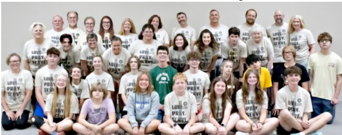
Trinity's 2025 Adult & Youth Mission Teams

No matter how many times they've gone, each trip brings something new, and God meets each student right where they are. As Jesus calls us, "Go therefore and make