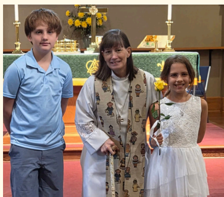
Six youngsters received their first communion in September: