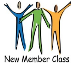
New Member Class

Join us for Rally Day on Sunday, September 7th at 9:30am in Fellowship Hall as we continue to learn together about how God's Love is MAGNIFIED! We'll have a light breakfast, activities and information for the WHOLE FAMILY. There will also be information shared regarding Drop-Off and Pick-Up this year, as well as important dates for your calendar.