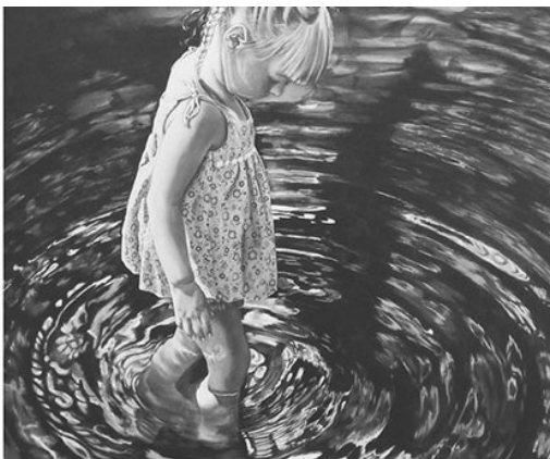
Ripple of the Mountain