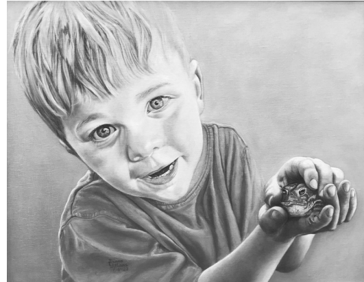
Look Mom! Oil