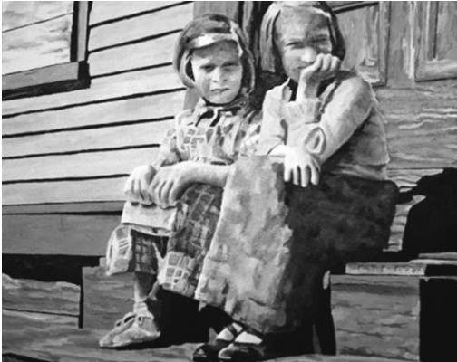
Before School Oil

Voting will be the weekend of November 11th & 12th.