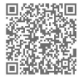
Scan to schedule an appointment.

Make an impact. Come give blood 4/8 to 4/28 for a $10 gift card by e-mail to a merchant of choice!