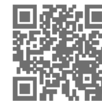
Scan to be directed to RapidPass®

Make an impact. Come give blood 4/8 to 4/28 for a $10 gift card by e-mail to a merchant of choice!