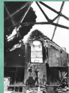
Western Avenue Church Fire