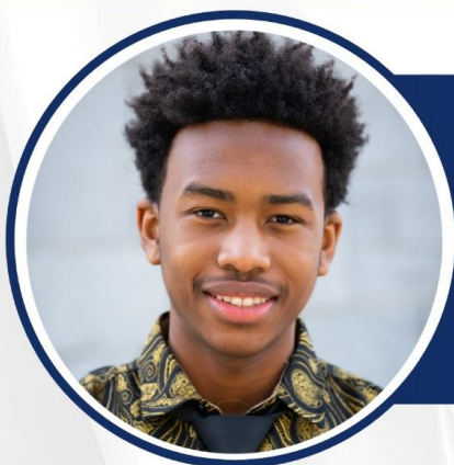
QUASHAWN RODNEY GARRETT MIDDLE SCHOOL

Award for increasing Math inventory score by more than 100 points.