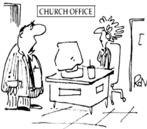
"Great, our first cruise and it rains for 40 days and nights."