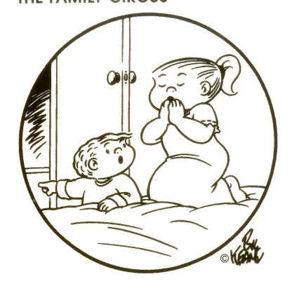
"No, Dolly, our father art downstairs watching