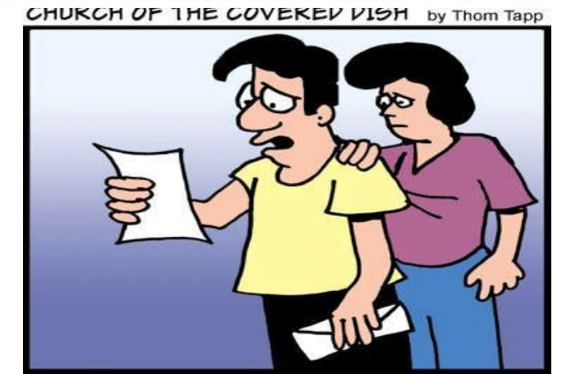
'Its from our church... we've been called up for active duty."