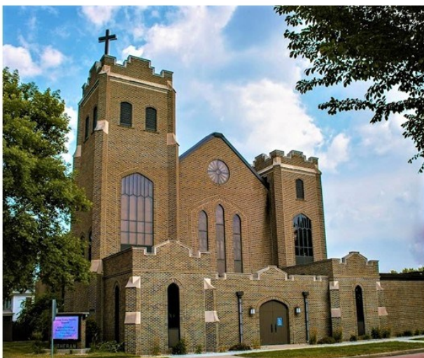
100-year celebration of the laying of the cornerstone of the current church was held in 2021

For I know the plans I have for you, declares the Lord, plans to prosper you and not to harm you, to give you a future and a hope. Jeremiah 29:11.